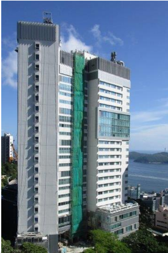
Overall view of SSQ