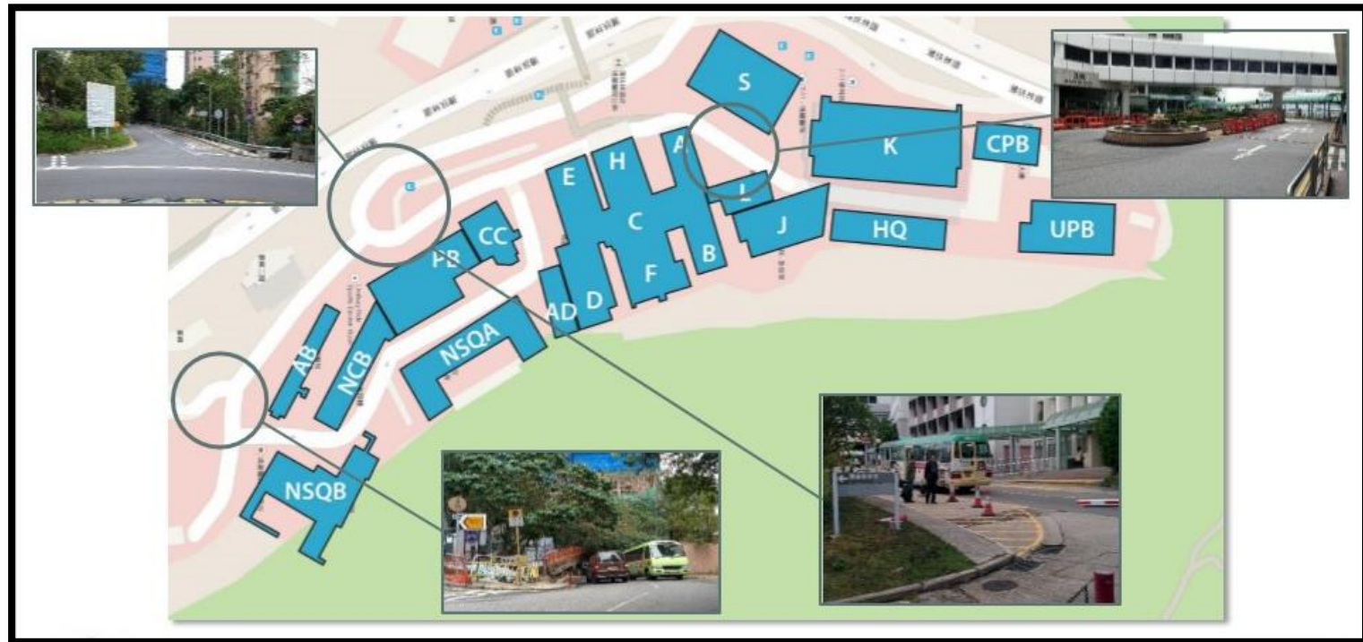
Review of major traffic intersections