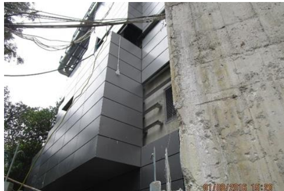
Cladding installation at L00