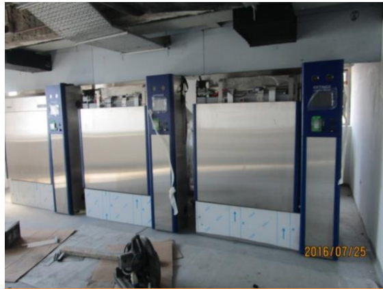
Autoclave installation at L18