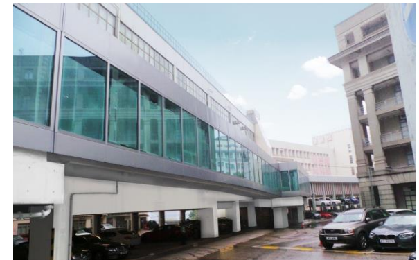
New Link Bridge