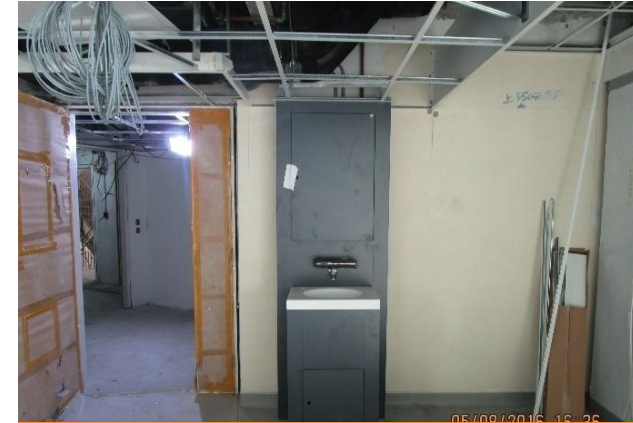
Wash basin installation for Lab at L20