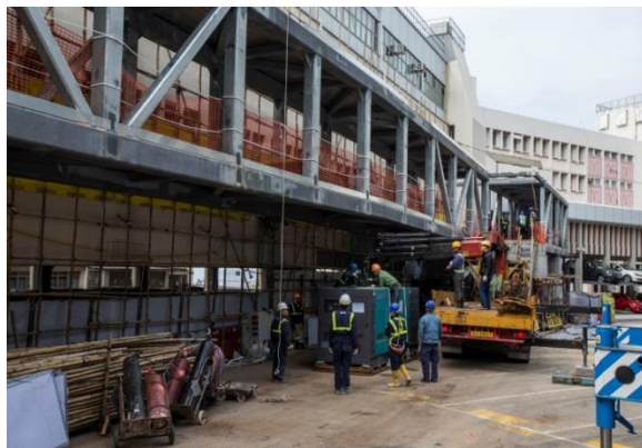
Steel truss fabrication works