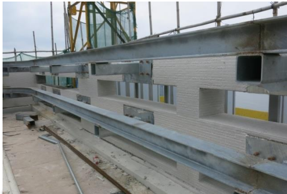
Installation of Building Maintenance Unit (BMU) at L24