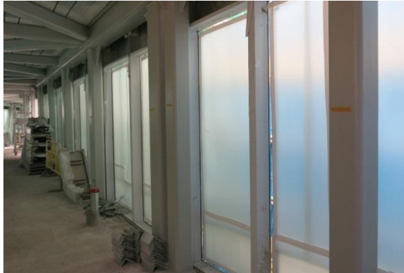
Installation of cladding and glazing at link bridge