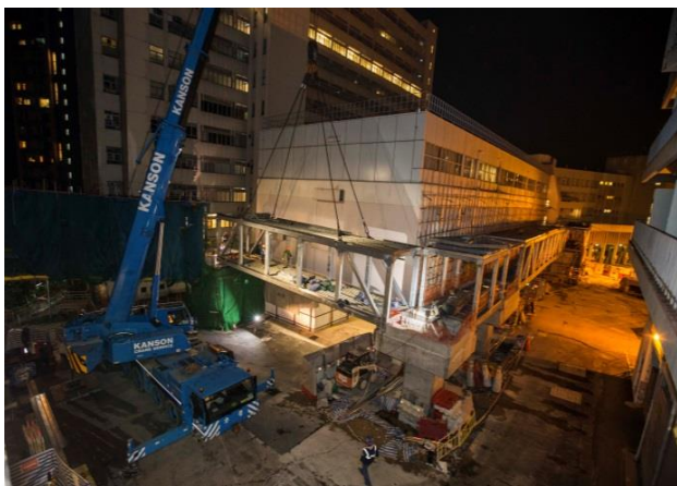
Delivery, erection and installation works carried out at night time