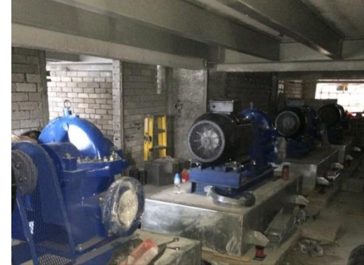
Chilled water pumps were delivered to site