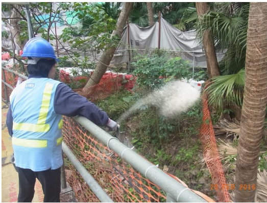
Spraying diluted and safe larvicidal oil and sand