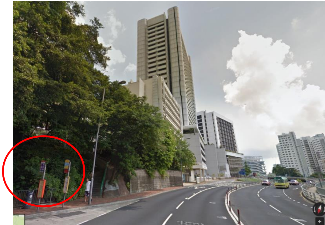
Southbound bus stop outside CPB (Currently suspended)