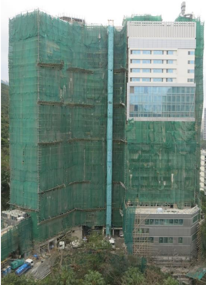
Overall view of SSQ