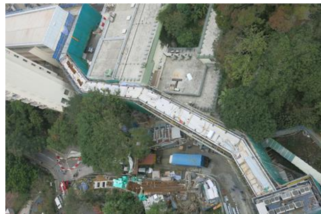
General view of New Link Bridge