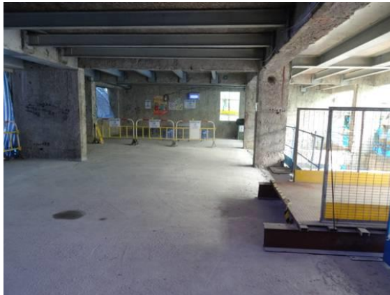
Concreting works for slab and beam at L15