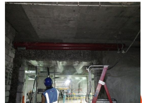
Installation of pipes at L21