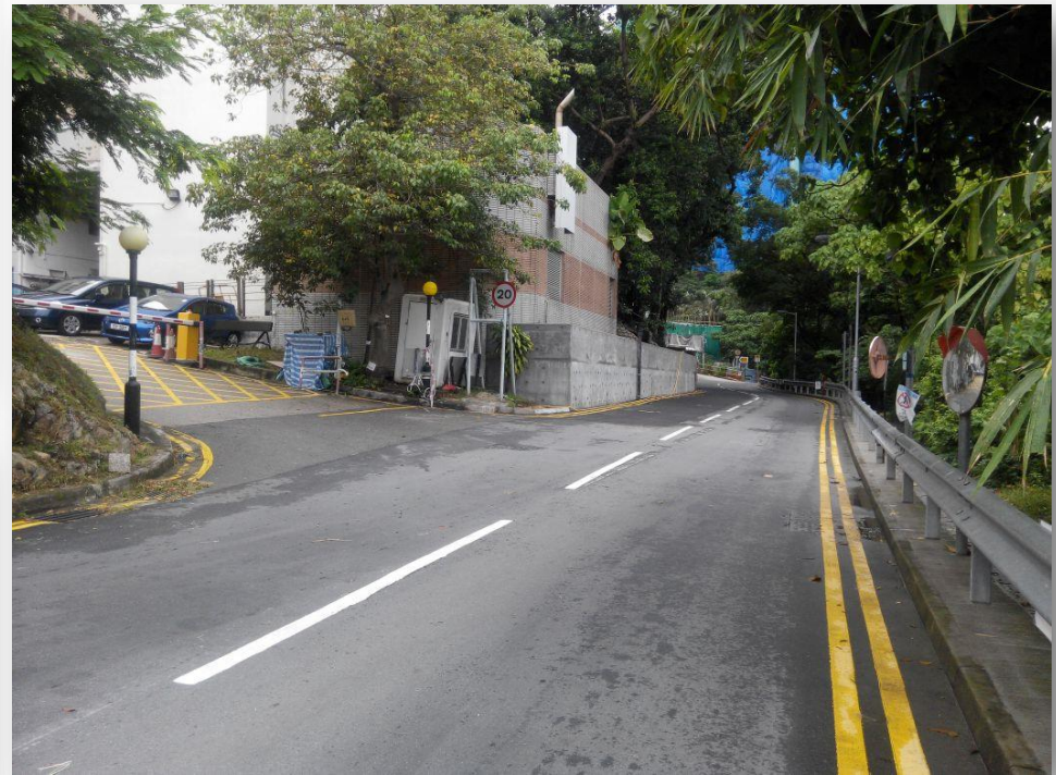
Road B after widening