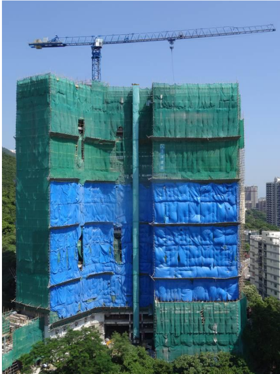
Overall view of SSQ