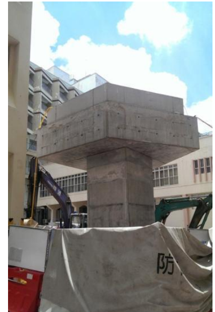
Construction of new Link Bridge