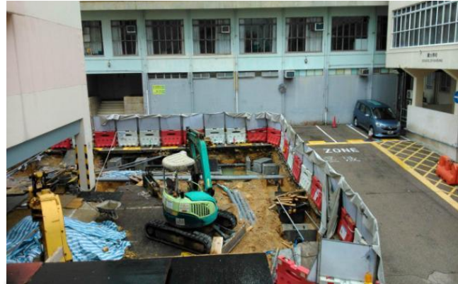
Underground utility diversion works