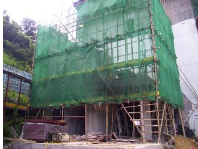
Construction of New Extension Block