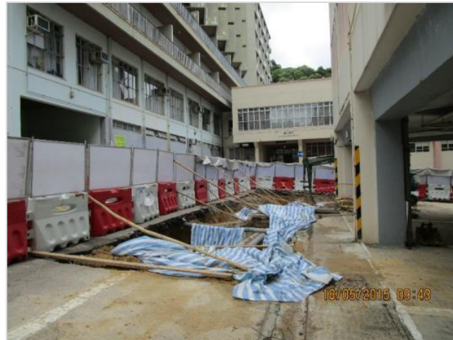
Underground utility diversion works