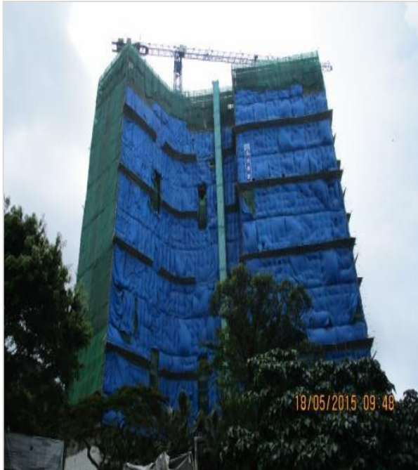
Overall view of SSQ