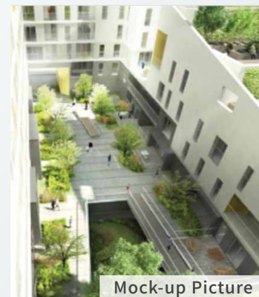
Green spaces in KTH

Following consultation, patients can obtain a pharmacy queue ticket either from the electronic kiosks or via the EasyQ function in the “HA Go” mobile app. A notification will be sent when their prescribed medication is ready for collection at the pharmacy.