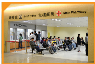
Shroff & Pharmacy, 1/F