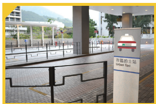
Taxi Stand, 1/F