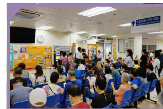
Blood Taking Centre, G/F