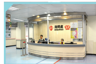
Enquiry Counter, G/F