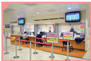
Emergency & Admission Registration Office , G/F