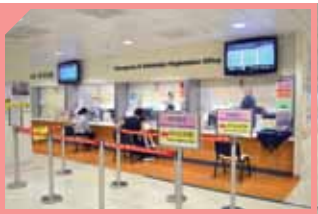
Emergency & Admission Registration Office , G/F