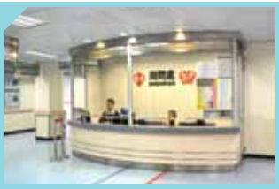
Enquiry Counter, G/F