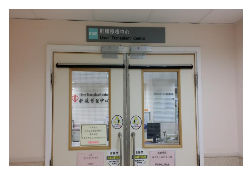
Liver Transplant Centre