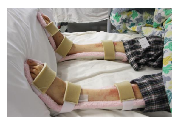
Figure 4: Foot splints