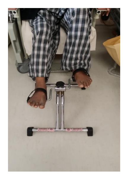
Figure 3: Bike: for limb exercise