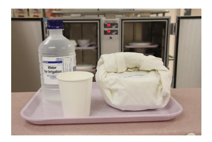
Figure 1: Post liver transplant clean diet and water

After the operation, doctors will advise you to resume a regular diet as soon as possible to obtain adequate nutrition. When you first resume diet, you will experience loss of appetite, nausea, flatulence, or even vomiting. This is probably because the residual effects of anesthesia and slow bowel movement after the surgery. You will recover in a few days and your appetite will gradually improve. We recommend you to reduce the regular meal size and eat between regular meals. Do not get too full and avoid taking a lot of liquid before and after meals. The nurse will arrange you clean diet and drinking water, see figure 1, so family does not need to bring you food. Dietitian will also see you and design the postoperative eating plan.