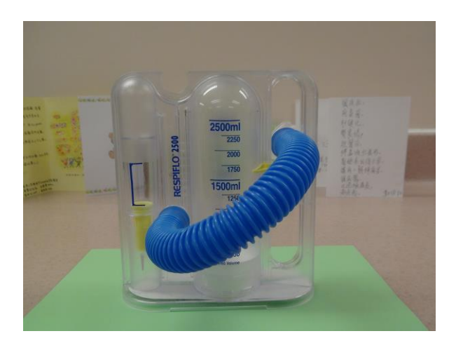
Figure 2: Breathing exerciser

Apart from obtaining sufficient nutrition and taking medications at specific times, mild exercise is essential for recovery. In the first few days after surgery, you should get out of bed and sit on chair for at least 1-2 hours every day. Please do more deep breathing exercise because it helps your lungs to expand and enables you to cough up sputum easily or use your self-financed breathing exerciser (see figure 2).