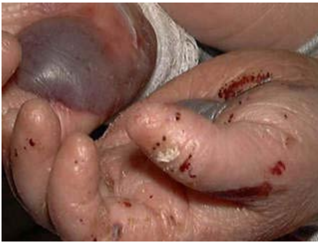
Large blister over palms