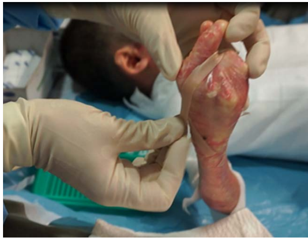
Scarring resulting in contracture and fusion of fingers