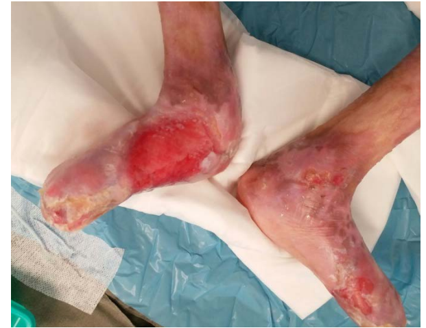
Chronic wound over feet