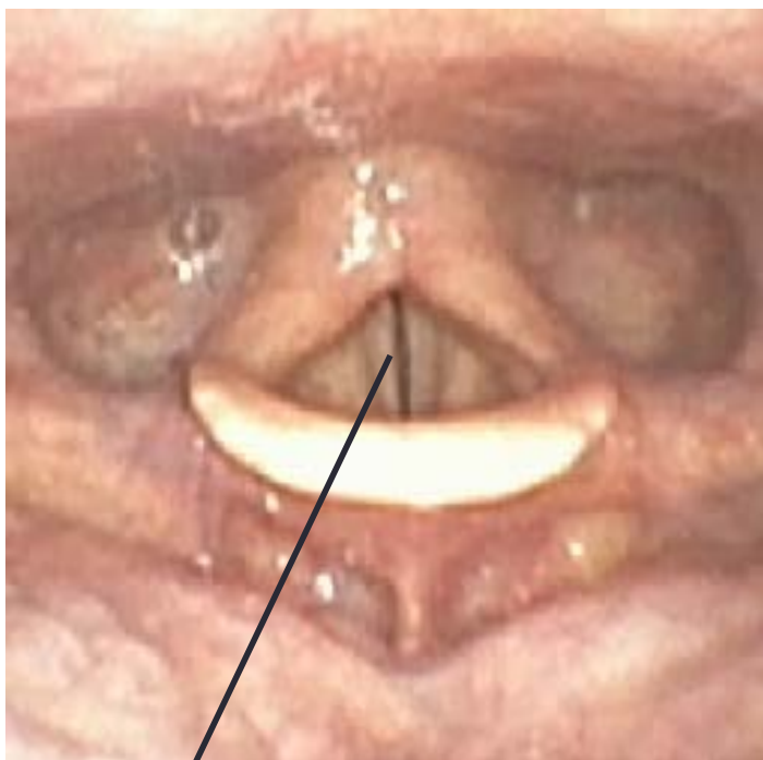
Glottic gap on adduction