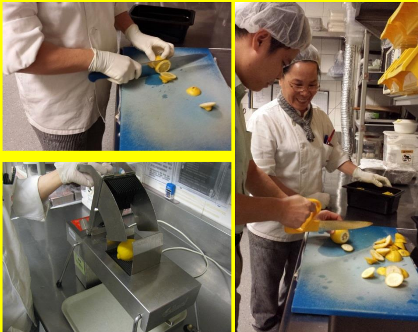
From Manual to automation