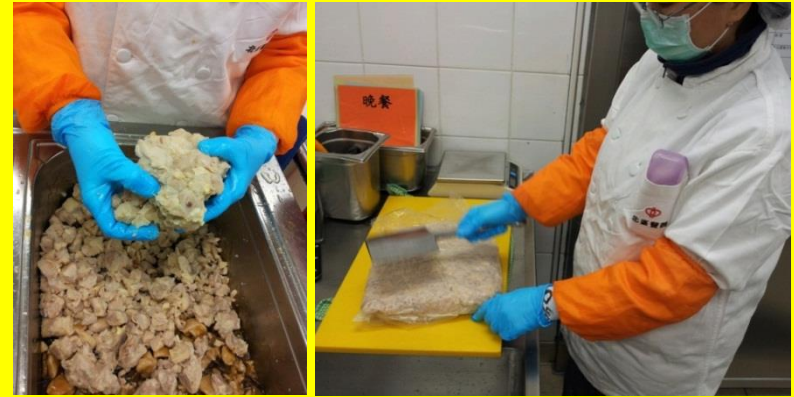
Proper selection of hand tool