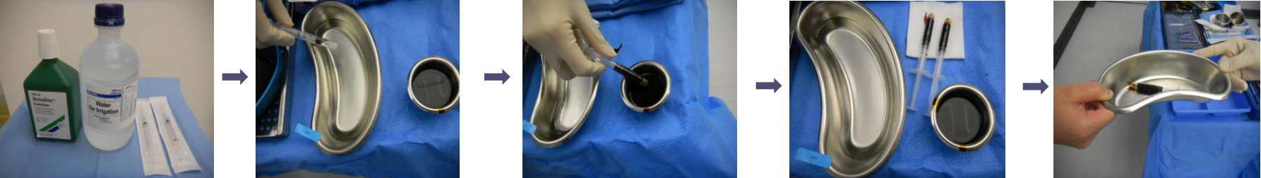
5% Povidone-Iodine are ready for use