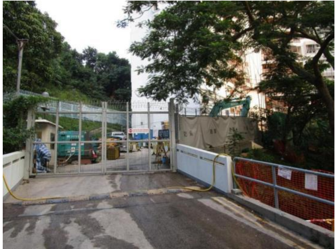
Entrance to SSQ