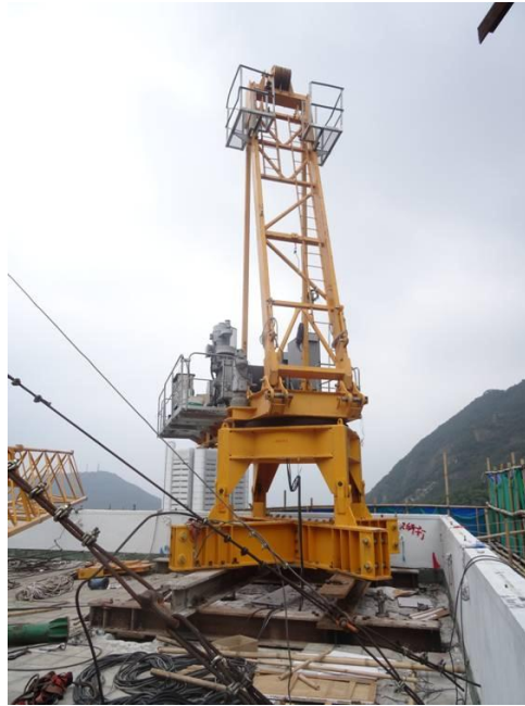
Installation of derrick at L23 in progress