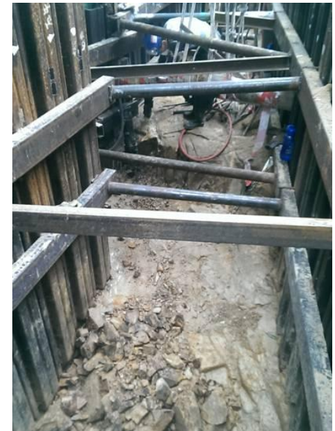
Rock Hacking at Mass Concrete Wall