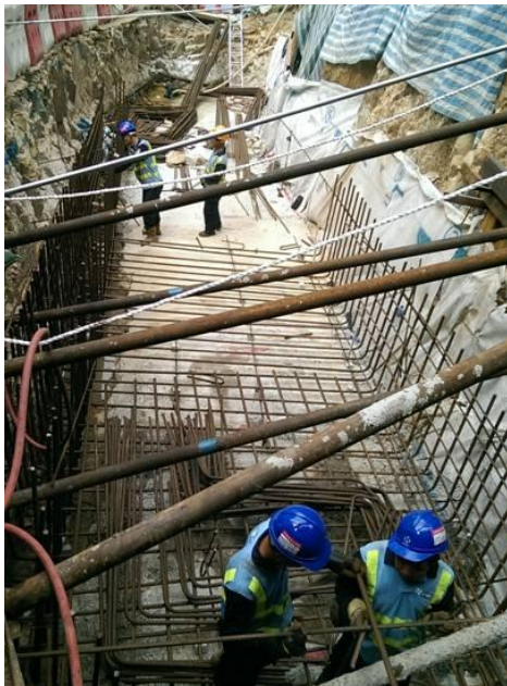
Reinforcement for Retaining Wall Footing