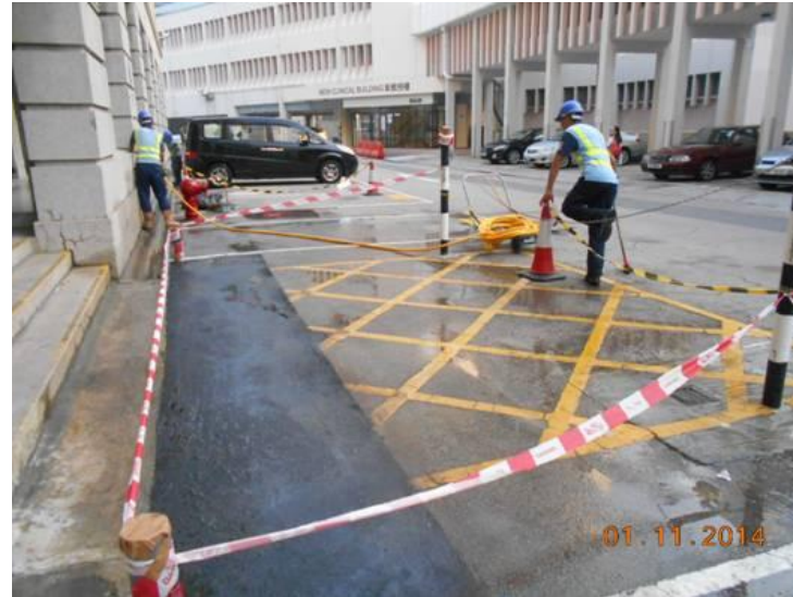
Re-surfacing for Double Deck Parking