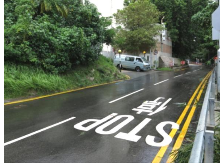
Road B current condition (2)