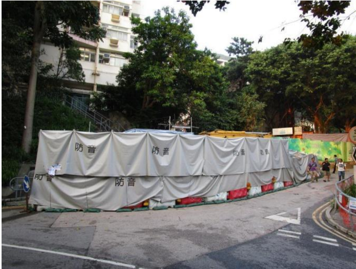
Noise barrier for Road D works