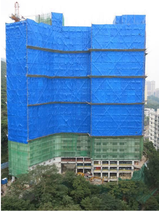
Aerial View of SSQ