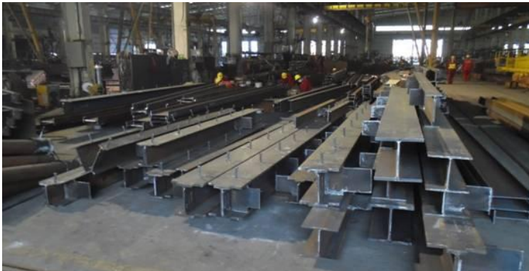
Fabrication of steel beam in progress