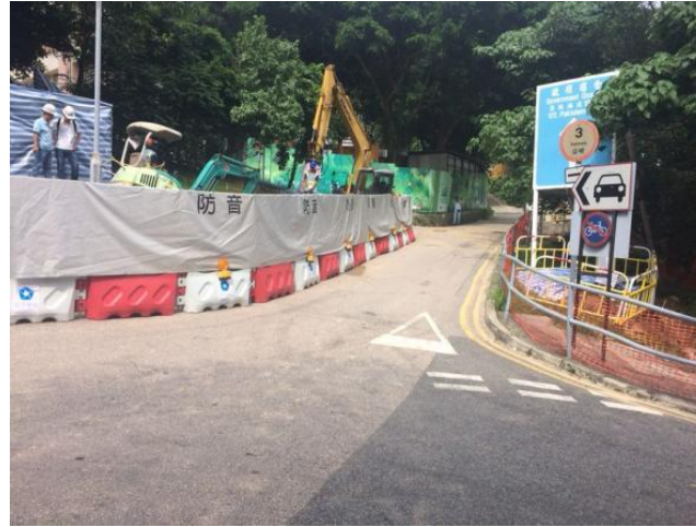
Road D works area