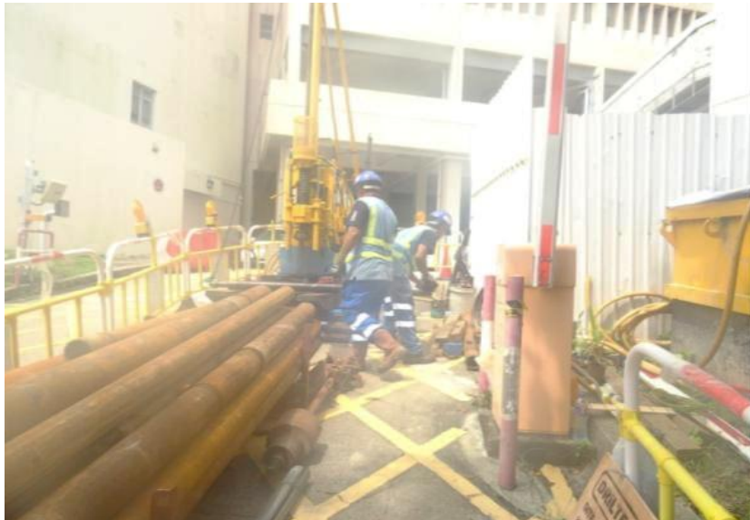
Geotechnical investigation works