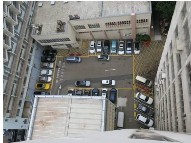
General Aerial View at Link Bridge Site Area