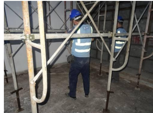
Installation of metal scaffolding for demolition