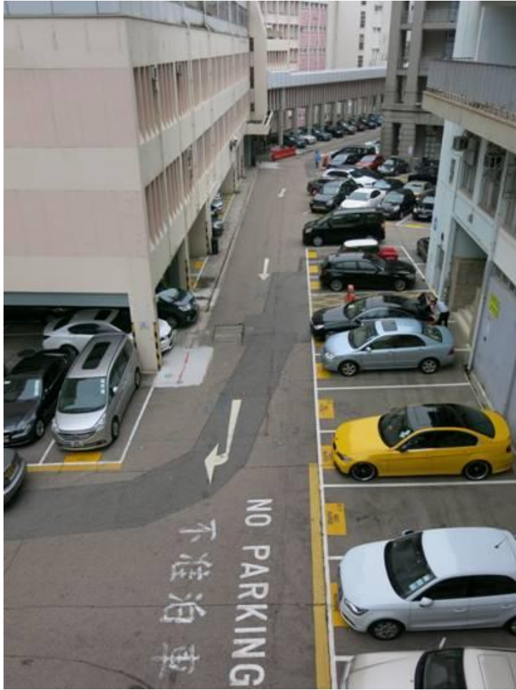
General View at Link Bridge Site Area