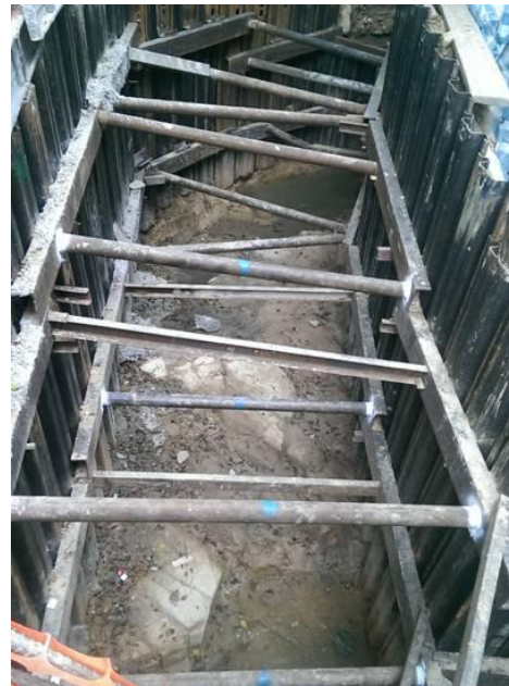
Excavation to the Top of Rock Head