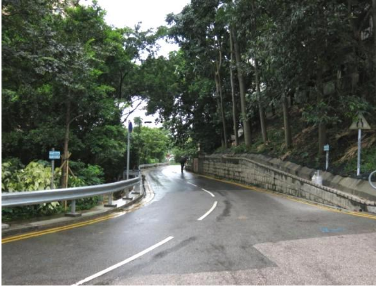
Road B current condition (1)