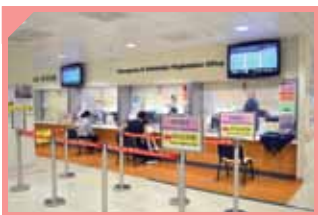
Emergency & Admission Registration Office , G/F