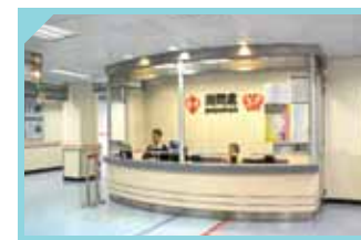
Enquiry Counter, G/F