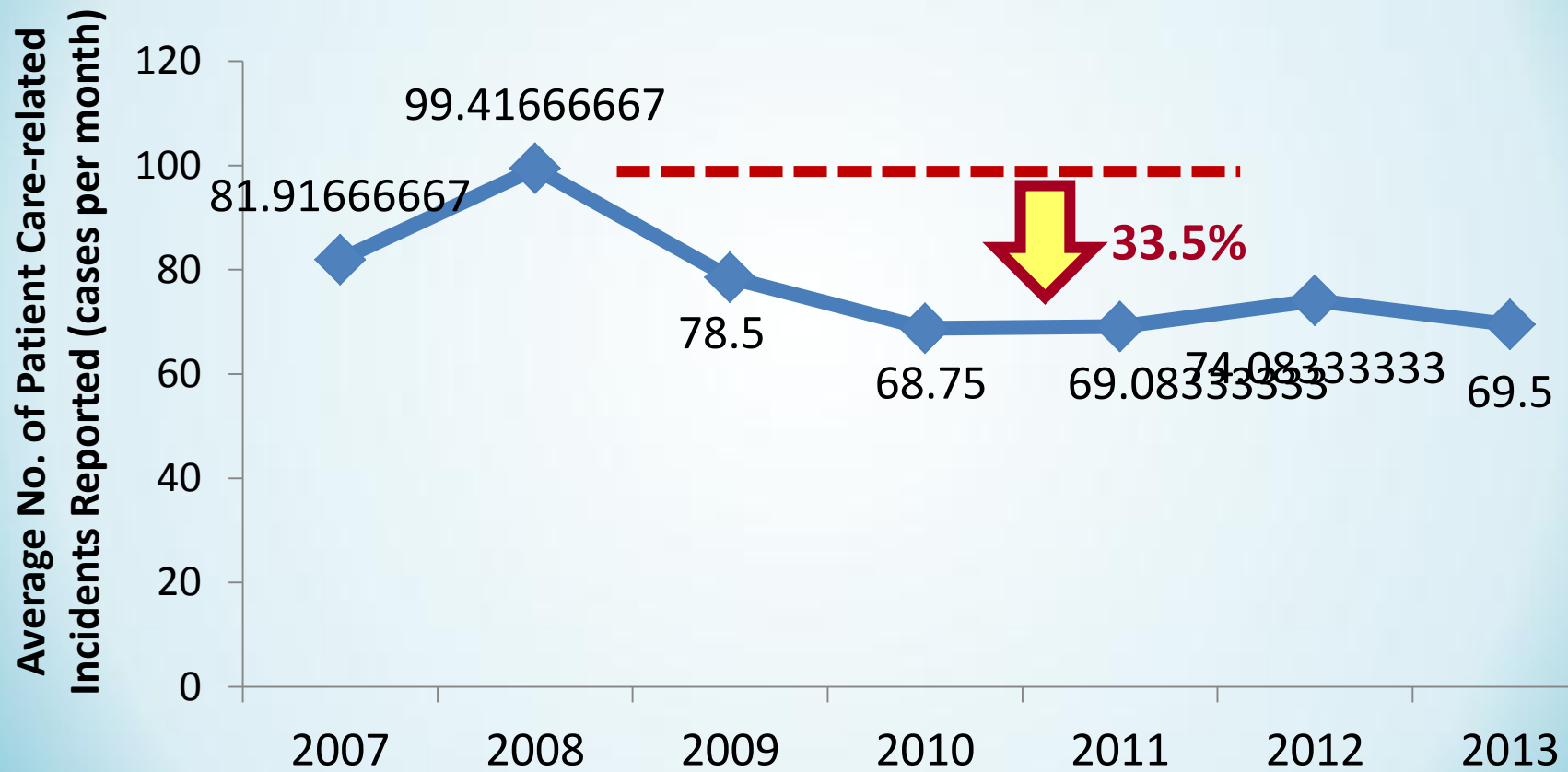
No. of Patient Care-related Reported Incidents in Tuen Mun Hospital (average cases per month)